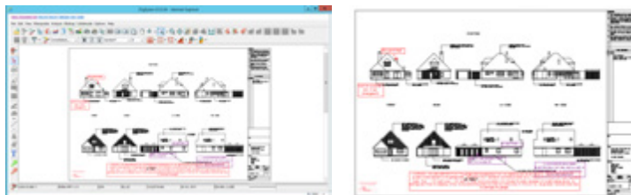
Users can review plans from familiar Accela workflows and screens

Cities and other public sector organizations can further exploit their investment in Accela when using DigEplan. DigEplan enables Accela users to efficiently work with electronic plans that need to be viewed, commented upon, stamped and rejected or approved. The solution also supports, citizen taxes, civil engineering and other departments. The integration to Accela allow users to instantly access plans for viewing, annotation, stamping and archiving, removing the need for paper, end-to-end.