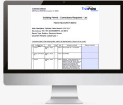
Automatic generation of DWG & BIM