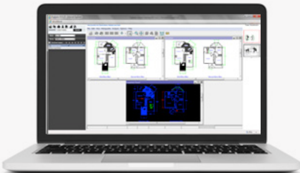
Quickly & easily spot hard to see differences in subsequent review cycles

DigEplan for Accela provides a rich set of annotation entities that allow reviewers to communicate, comment and add in-context observations and instructions, directly within plans and other document types. All annotations are created as distinct overlays on top of the original file, never altering the original, and are saved directly into Accela for audit purposes. Plan reviewers and departments can turn annotation layers on and off to make viewing easier, and consolidate comments as needed to make decisions and provide correction comment feedback, supporting review cycles.