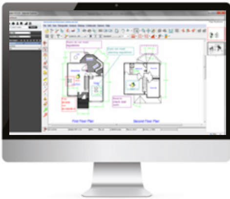
DigEplan for Accela enables users to work with electronic plan review cycles from within Accela